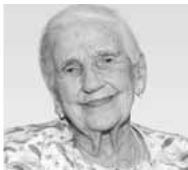
Patron Dame Elisabeth Murdoch AC DBE