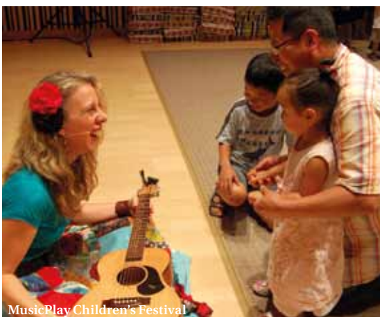
MusicPlay Children's Festival

Our Local Heroes program celebrates the very best home-grown talent. Local Heroes ensembles present a series of concerts that span the range of classical music making – from early music, choral and song to Classical, Romantic and new music. The breadth of this dynamic program engages audiences through their love of fine music and providing them with an opportunity to get to know the celebrated musicians who call Melbourne home.